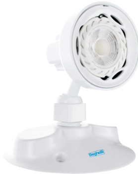
LED MR 16