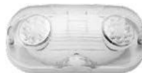
Wet Location Model