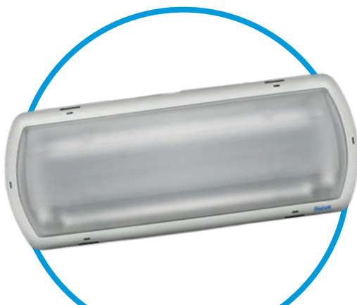
TEMPESTA LED ECO