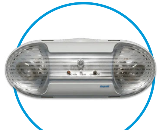
ECCO LUNA LED