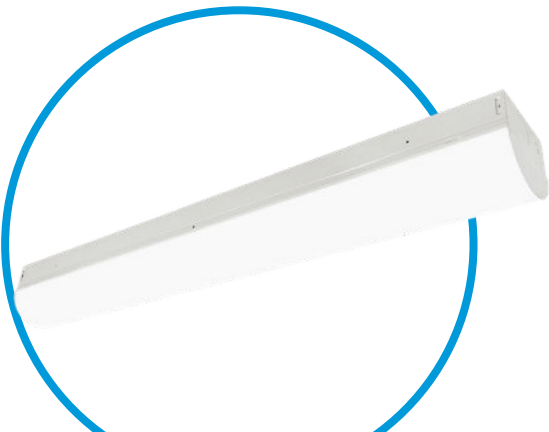
SWL SEL (4')

DLC PREMIUM qualified for stairwells & passageways