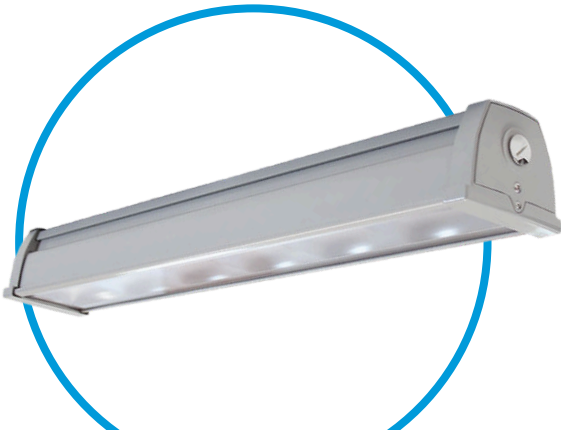
ACCIAIO BX910LED SE