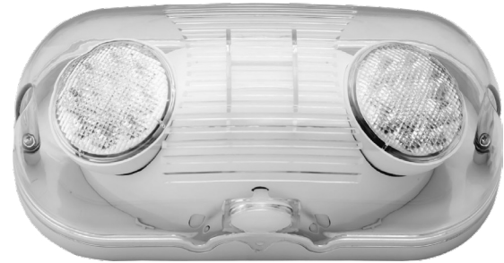
(PACO-PEH wet location)