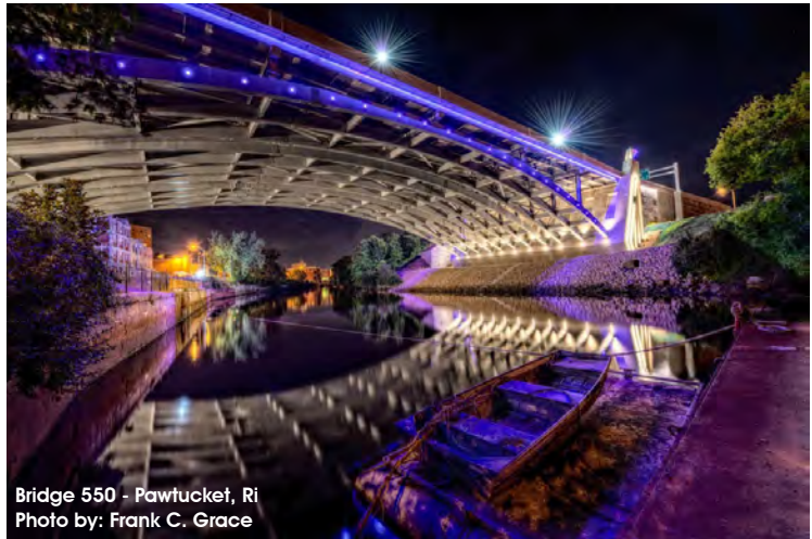
Bridge 550 - Pawtucket, Ri